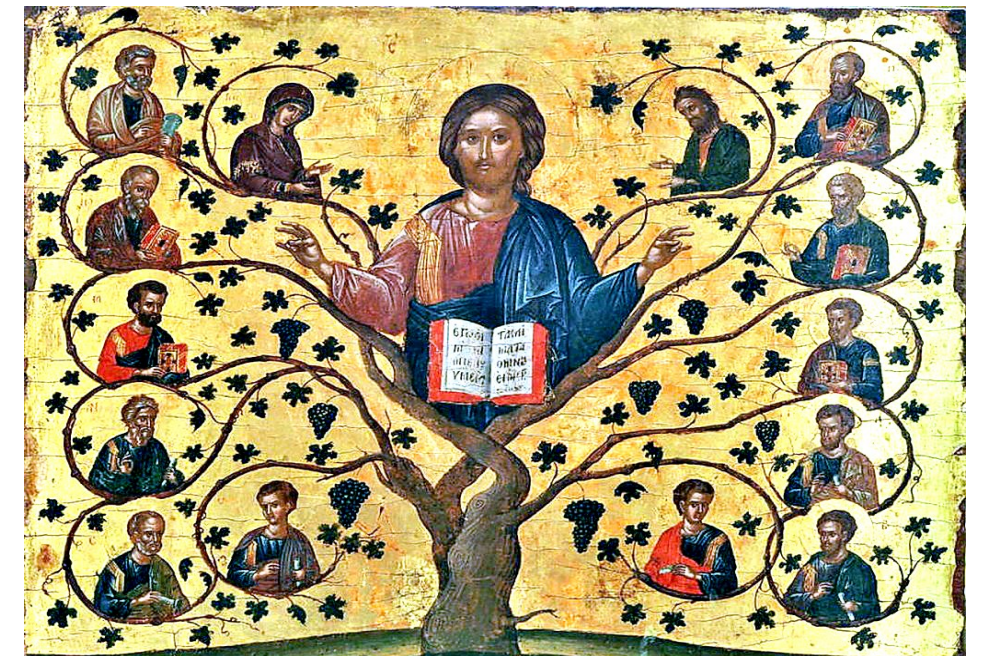
Jesus said to his disciples, "I am the true vine, and my Father is the vinegrower."

Book of Common Prayer = BCP Red The Hymnal 1982 = Blue Wonder Love and Praise = WLP Green Alleluia III = Yellow